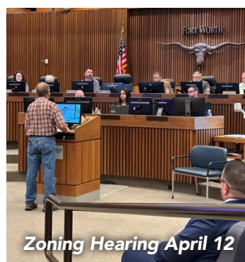
Zoning Hearing April 12