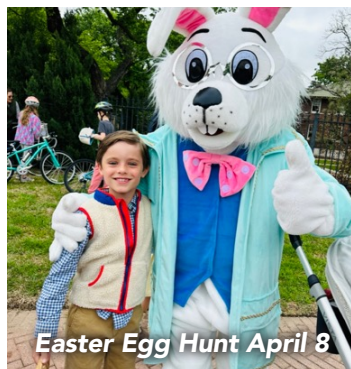
Easter Egg Hunt April 8