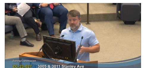
Zoning Hearing April 12