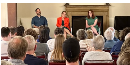
Candidate Forum April 17