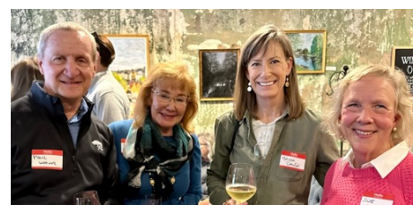
New Neighbor Mixer March 30