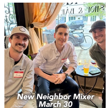
New Neighbor Mixer March 30