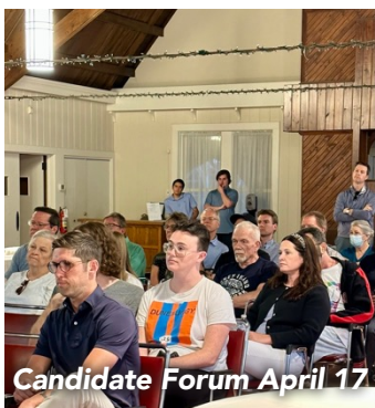
Candidate Forum April 17

A quick look at what's been going on in the neighborhood!